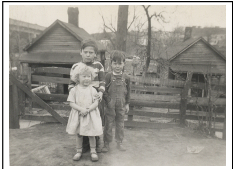
Figure 8: Children behind the Laffoon family's shotgun home at 848 DeRoode Street, ca 1950s.

Residents adopted numerous strategies to cope with the elements and conditions. Newspaper and cardboard were often used as insulation. Neighbors shared water pumped from local wells, and often gathered for community meals. Children often slept on the front porch to escape summer heat. The small size of shotgun homes made front yards crucial work areas. Many photographs show men working on cars along DeRoode Street. Many backyards held privies (out houses), chicken coops, gardens and fruit trees. Canning fruits and vegetables was a common way to store homegrown foods. Archaeologists recovered thousands of fragments from canning jars from the privy behind 710 DeRoode Street.