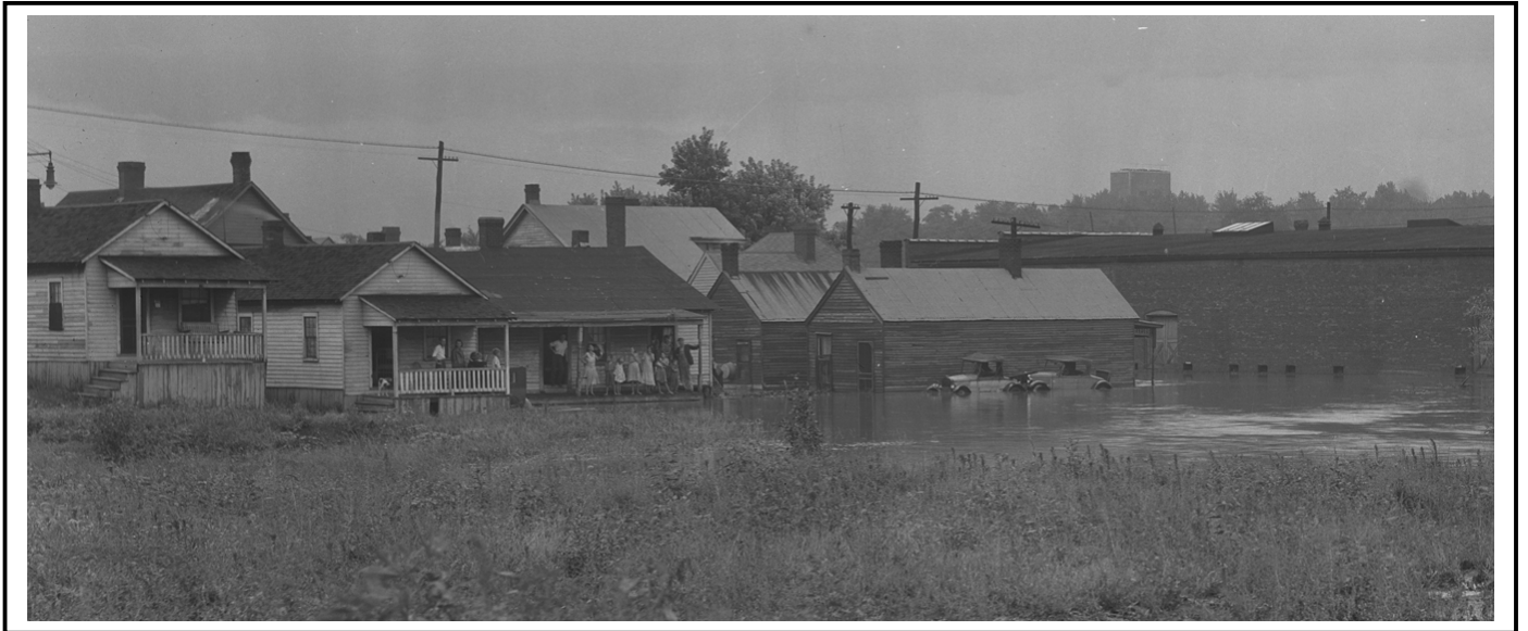
Figure 7: Residents stand on the porches of two shotgun homes on Chair Avenue in Davis Bottom during a flood in 1932.

Life was tough and cramped for residents who grew up in a shotgun house in Davis Bottom. From the 1860s to the 1940s, many homes did not have such utilities as indoor plumbing for running water or toilets, central heating, insulation, window screens or telephones. Residents often heated their homes and cooked using cast-iron, potbelly stoves that burned wood or coal. Flooding and fires were a constant danger. Seven houses were destroyed or damaged when a fire swept through a row of shotgun homes on the 700 block of DeRoode Street on August 4 th , 1930. The blaze was caused by someone burning rags to drive off mosquitoes ( Leader 1930).