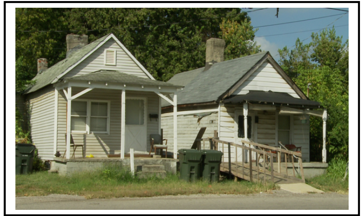
Figure 1: Shotgun houses at 710 (left) and 712 (right) on DeRoode Street, Davis Bottom.

Many of the residential homes built in Davis Bottom were an architectural style commonly known as the "shotgun" house. This single-story, wood-frame home was built throughout the Southern United States from the 1860s to the 1920s. Shotgun homes are inexpensive, rectangular structures designed to fit narrow lots on urban streets. The two shotgun houses at 710 and 712 DeRoode Street (photo right) are the focus of the archaeology, architectural surveys and 2D graphics featured in The Davis Bottom History Preservation Project.