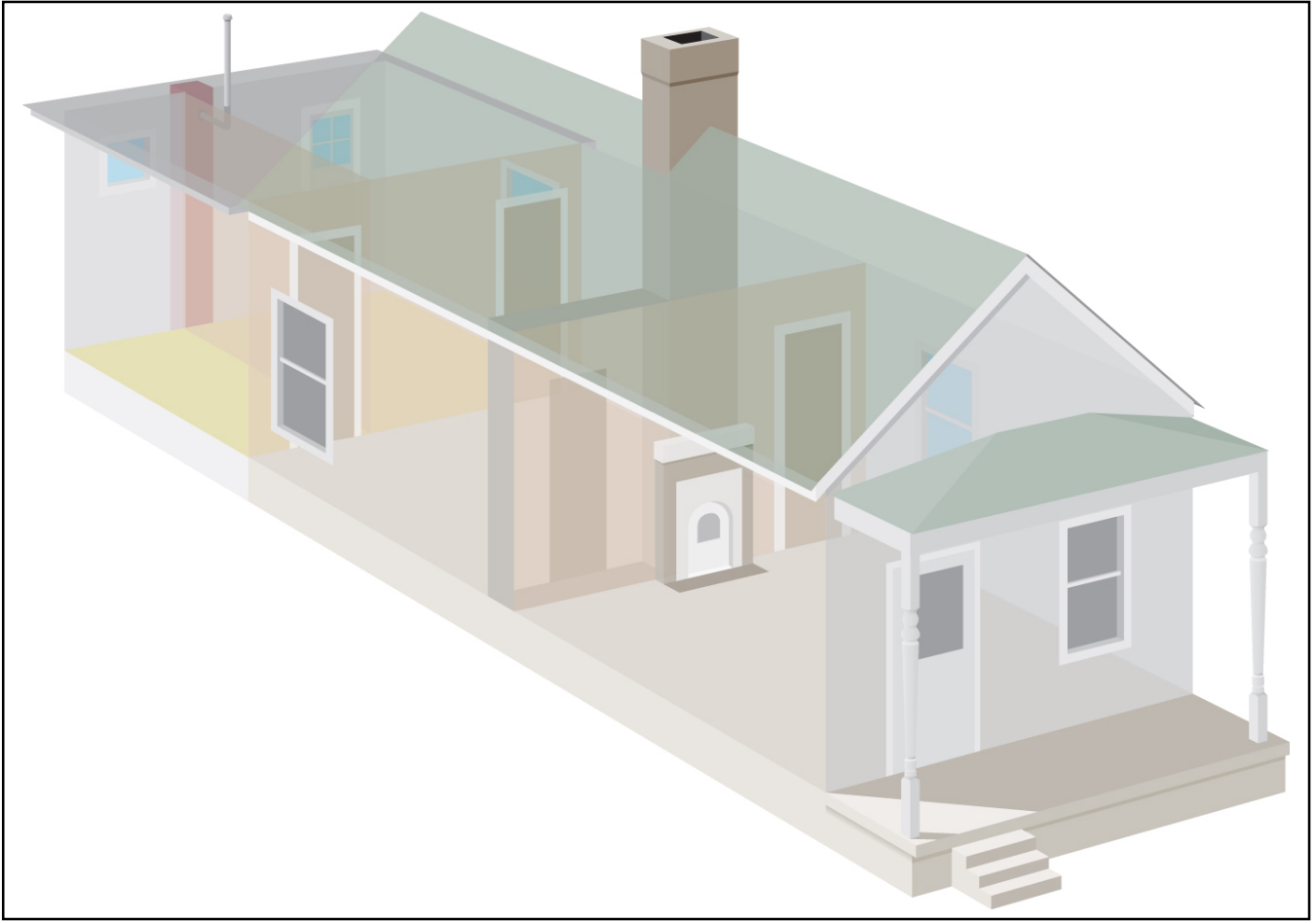
Figure 9: A 2D graphic of the shotgun house at 712 DeRoode based on field surveys conducted by scholars with the Kentucky Transportation Cabinet.