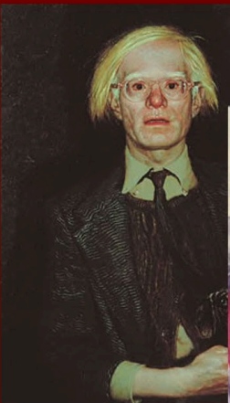
Andy Warhol, Self-portrait